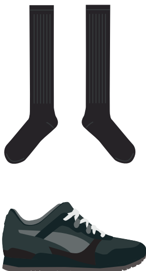
Trainers for sports activities only